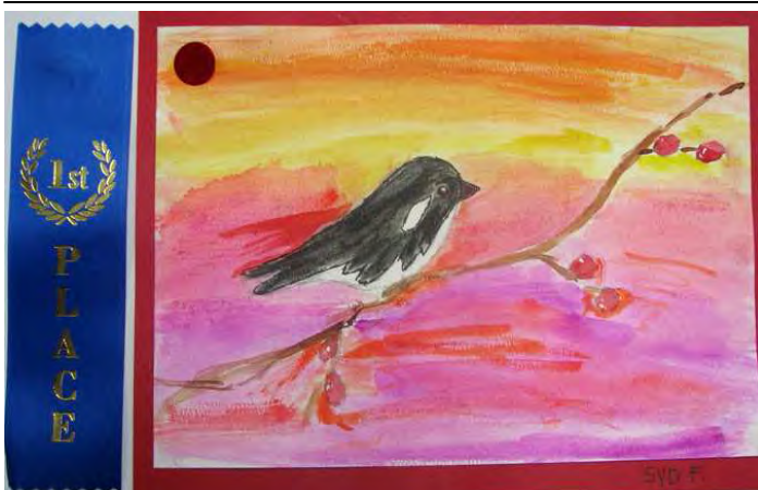
Syd F.'s winning entry in the 6-8 age category.

Looking for a unique gift? Consider a bird case sponsorship.