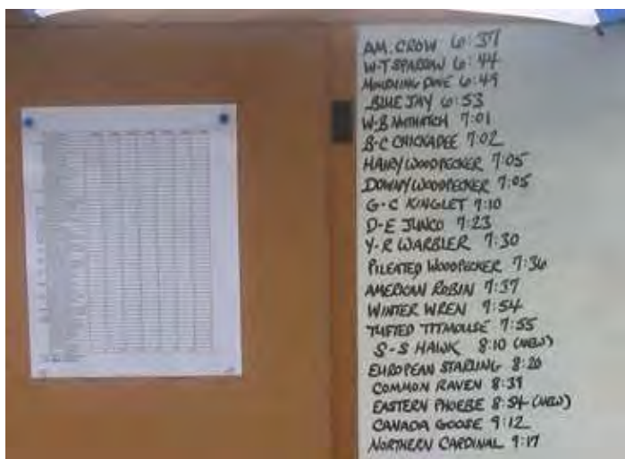
The running tally by mid-morning.