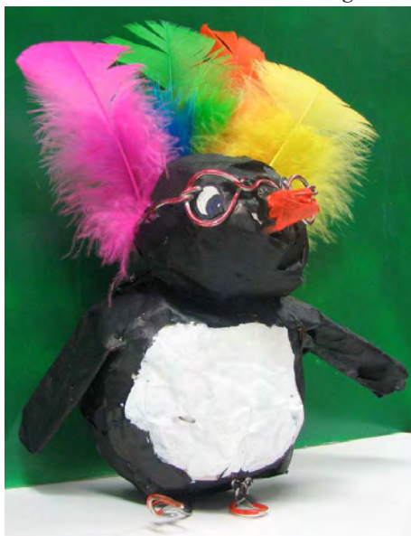
Esme Cole’s second place entry in the 3-D category.